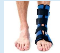
003-19 Ankle Pad V797D-50436