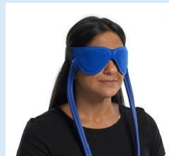
003-12 Eye Pad