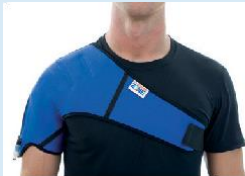
003-15 Shoulder Pad Fits up to a 44" Chest V797D-50436