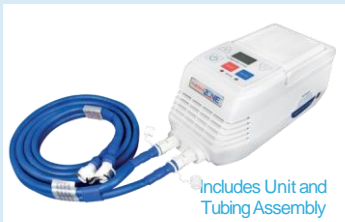
003-99 ThermaZone Therapy System