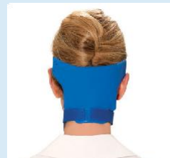
003-11 Occipital (Rear Head) Pad