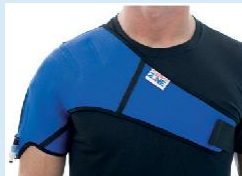
003-20 Large Shoulder Pad Fits up to a 54" Chest V797D-50436