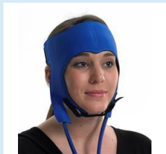
003-10 Front & Side Head Pad