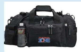
003-05 Carry Case (Holds unit and 4 pads) 003-03 CarCharger