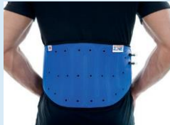
003-18 Back, Abdomen, Hip Pad V797D-50436