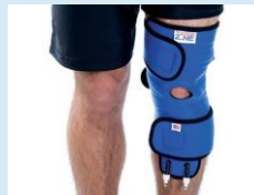
003-17 Knee, Elbow Pad V797D-50436